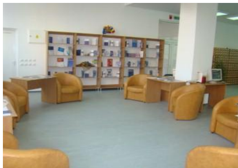
European Documentation Centre

2016 – The Library of Mechanics Faculty is moved in a new location.