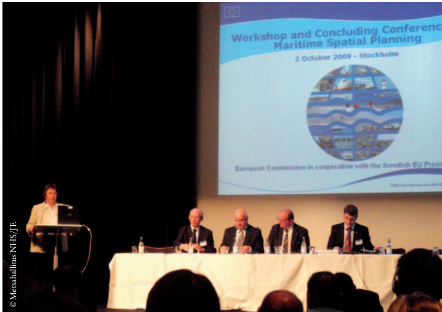
The European Commission's Maritime Spatial Planning Workshop, Stockholm 2009

Throughout 2009, the European Commission, working closely with