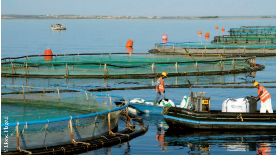
Aquaculture in Cyprus

The key to successful maritime spatial planning lies in acknowledging that all existing EU legislation and initiatives related to marine activities are intertwined and should be treated as different branches of one same tree. The Marine Strategy Framework Directive, for example, aims at improving the environmental conditions of EU waters by 2020 and the Recommendation on Integrated Coastal Zone Management seeks to ensure coherent action on the management of coastal areas at European level. Nor can we forget the importance